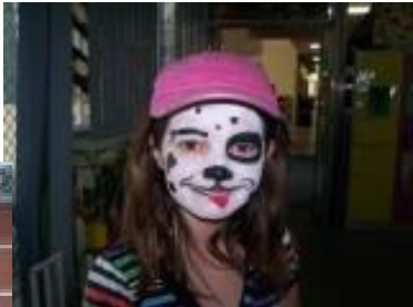
Fun for all - the best day ever at KIDS' ZONE!